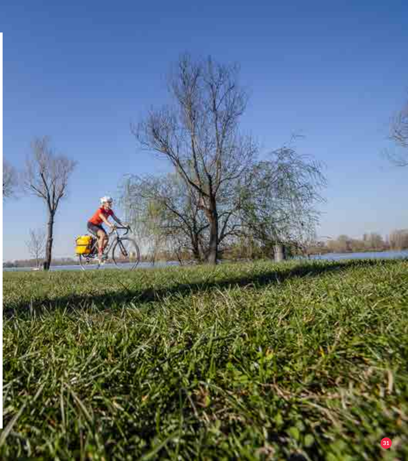
Photo Glimpes of the Mincio Cycling Path